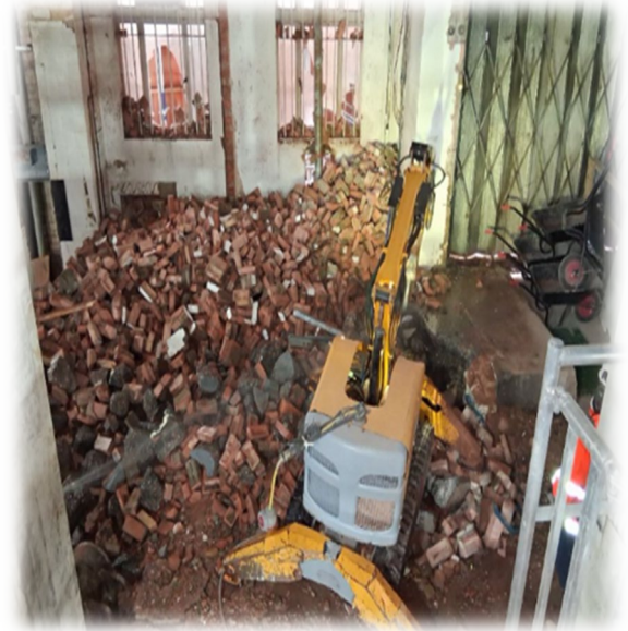
Removal of Old Northern Sub Station:

In 2018 the global construction industry spent £11.4 trillion. By 2030 this number is expected to reach £17.5 trillion.